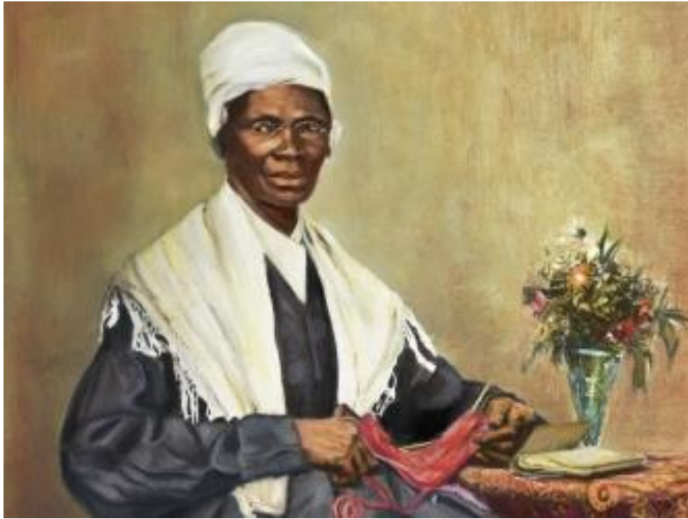
Sojourner Truth – Ain't I woman?